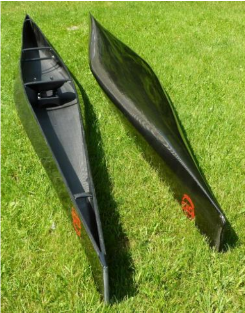
GRBNewman Concept 1 above; Stinger "winged" C1 to the right. The differences are obvious!