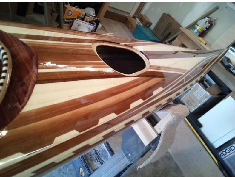
Fine and intricate detail abounds!

set lines, shaping the hull to help the boat maneuver in the water. Also the purpose of the sea kayak historically, where it was widely used as transportation.