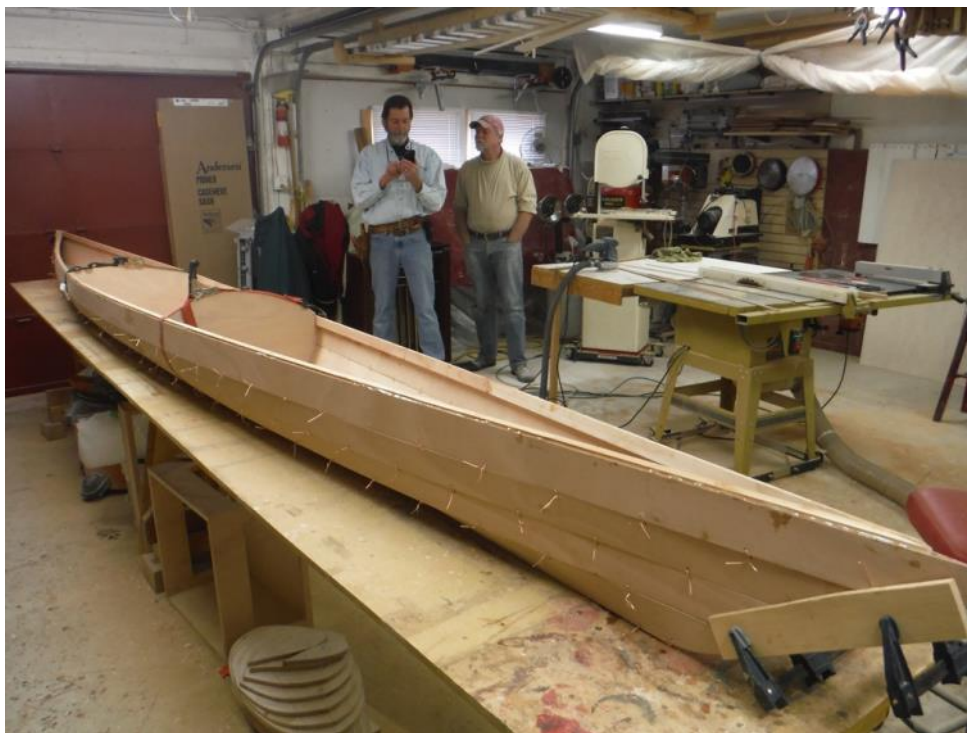
CLC West River 180 under construction.