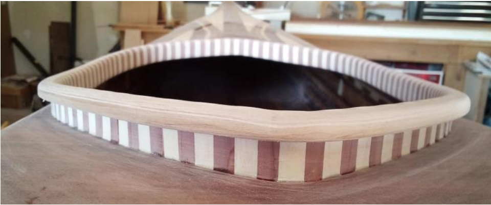
Intricate cockpit combing created from over 200 pieces!

live video feed of the drawing. My plan is to deliver the boat in person to the winner. But before I deliver it, I am going to sit in it on the lake! I won't paddle it, but I do want to at least sit in a kayak for the first time. As a side note, this kayak has the Ten Talents International symbol built into the deck. Over 200 pieces are going into the cockpit combing, representing everyone who gave for the project. I am hoping to have the build completed sometime in June or July 2019. The fund raiser will end when the boat is complete! Anyone who wants to know about Ten Talents International, a ministry to help