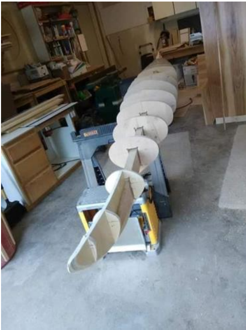
Guillemot build beginning.