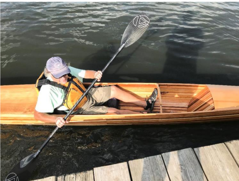
Putting the concept to the test!

boat rack; it is an example of what not to do. Live and learn.