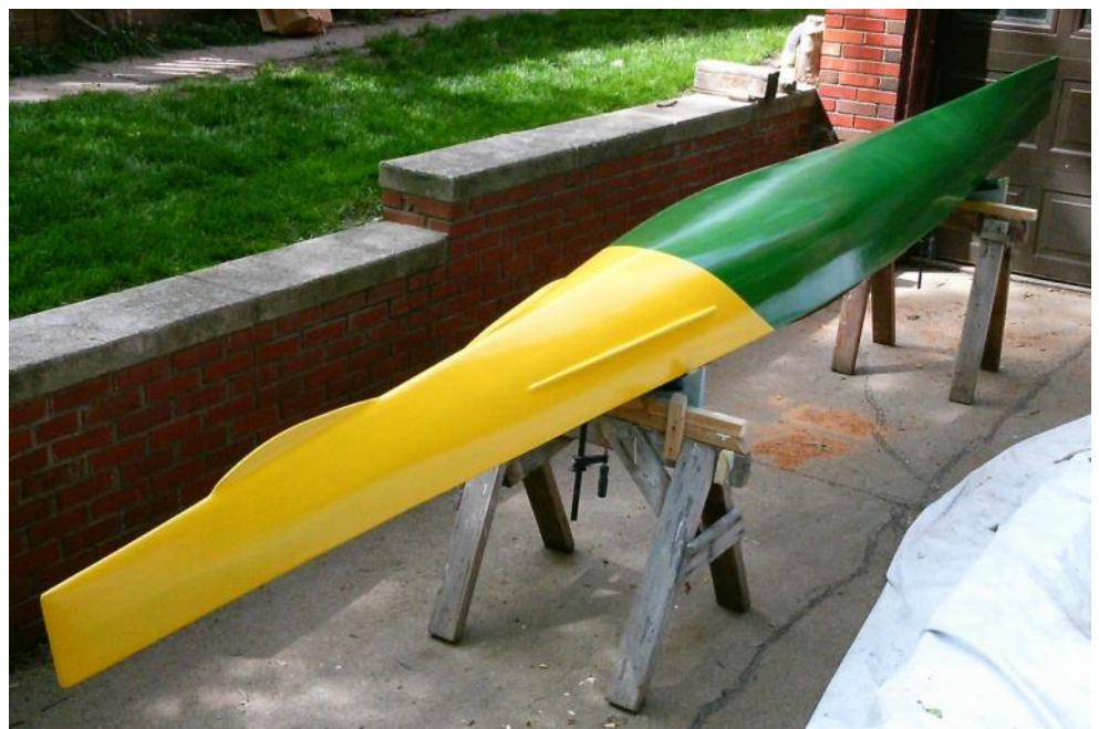
Hydrodynamic aids added to the hull of the second boat to help performance.

I finished it in January, primed the hull, and took it out to one of the ice free lakes. The rocket boat was dreadfully unstable. I didn't want to paddle it considering the below freezing temperatures and a good chance of capsizing. I never left the dock, hanging on to a dock post trying to find some semblance of balance. I admit I never did.