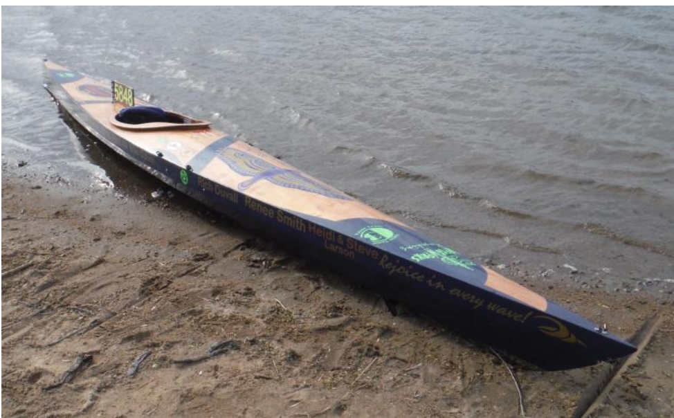
Finished CLC West River 180 by the side of the river.

My first boat was a Chesapeake Light Craft West River 180. Yes, it was a basic CNC pre-cut plywood kit. Yes, I didn't design it. But as I reviewed my situation it was the next best thing considering time constraints. In conversations with