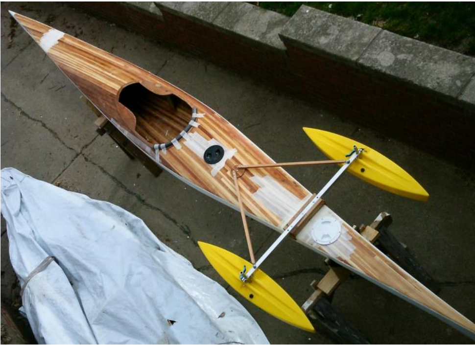
Second boat, with stabilizing amas.

a brand new QCC lightweight with a horrible paddle stroke, who appeared to be terribly overweight/out of shape; a frail looking older woman in a super clean Current Design Pintail; and another out of shape guy in a brand new plastic Riot. I ended the race two minutes behind them. I had hit the diabetic wall late in the race. Yes, dear and gentle reader, I am aware my age has something to do with it. Regardless I was not going to let my age lull me into thinking I was not going to improve.