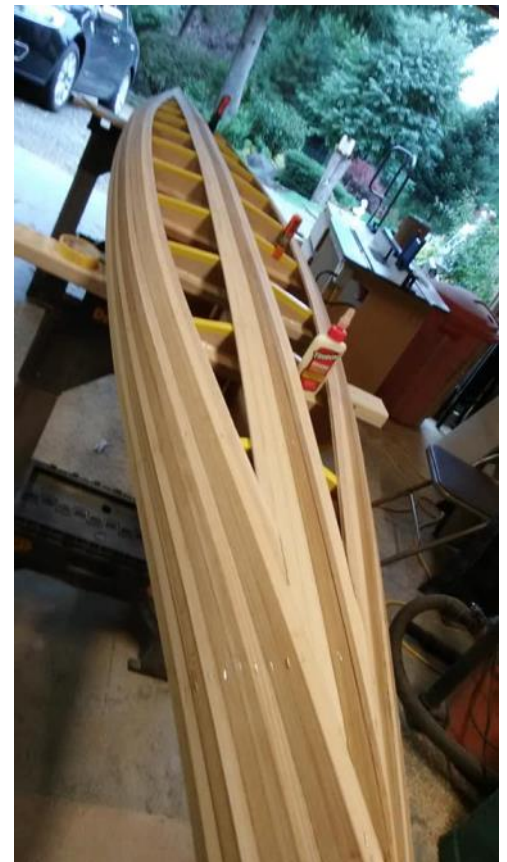
Wood strips being laid on the hull ribs.