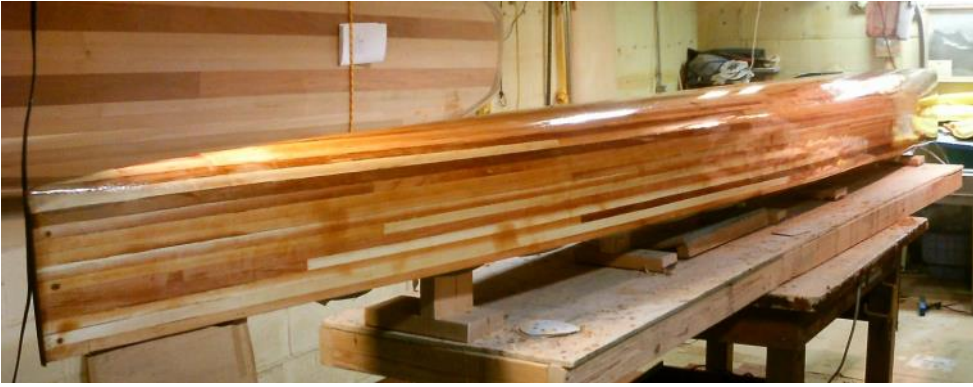
Third boat design under construction.