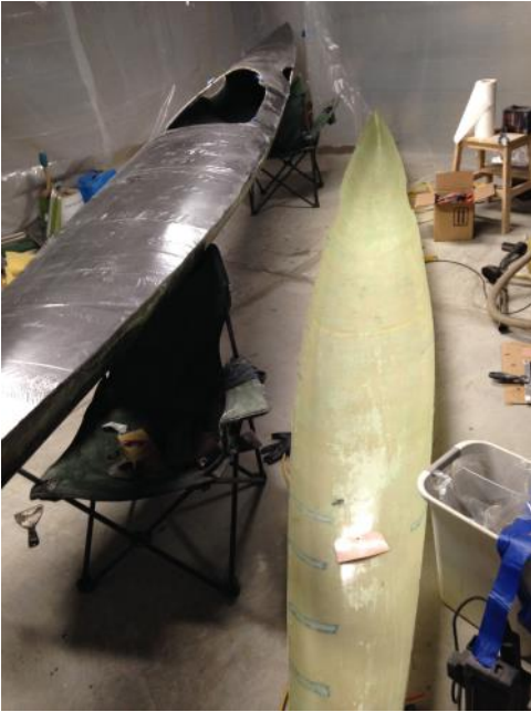
Carbon Minke molded from the wood strip Minke.