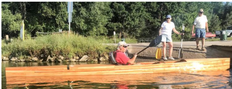
Third boat design ready to race!

Walt Vosicka WoggWorks Kayaking kayaking4eveyone@yahoo.com